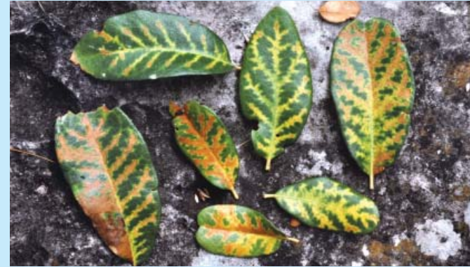
Figure 2 - Live oak leaves showing oak wilt symptom known as veinal necrosis.

Oak wilt diagnoses may be confirmed by isolating the fungus from diseased tissues in the laboratory. Samples can be submitted to: Texas Plant Disease Diagnostic Laboratory, 1500 Research Parkway, Suite A130, Texas A&M University Research Park, College Station, TX 77845. A county extension agent, Texas A&M Forest Service forester, or trained arborist should be consulted for proper collection and submission of samples.