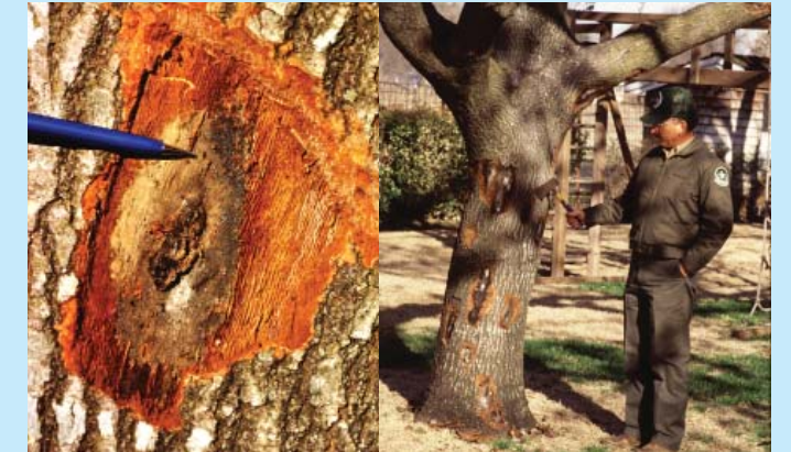
Figure 3 - (a) exposed fungal mat on Buckley (Spanish) oak; (b) multiple oak wilt fungal mats on dead red oak.

live oaks in Texas expand at an average rate of 75 ft per year, varying from no spread to 150 ft in any one direction. Occasionally, the oak wilt fungus is transmitted through connected roots between red oaks, but movement through roots is slower in red oaks and occurs over shorter distances than in live oaks.